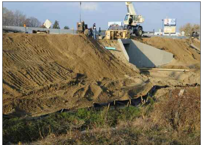
Crews extended the tunnel length on the north side in order to avoid erosion on the otherwise steep bank