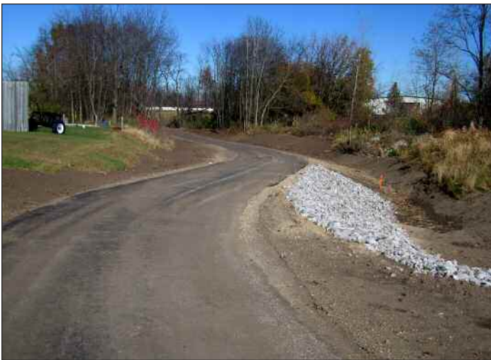
Looking north from CR 22 toward the tunnel