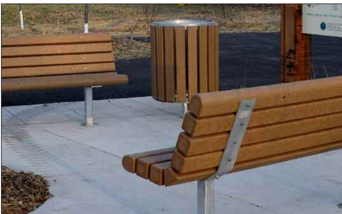
Benches enhance in the parking lot between CR 22 and CR 37