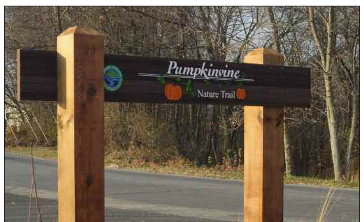
Sign along CR 37