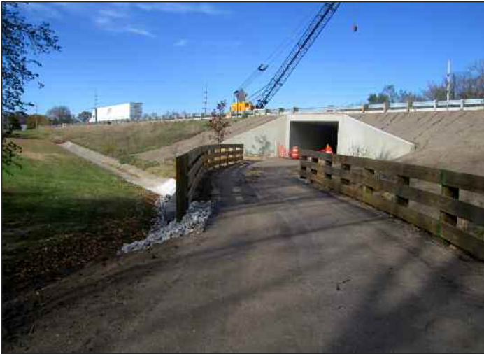
South approach to the tunnel

The tunnel that will eventually carry the Pumpkinvine Nature Trail under U.S. 20 south of Middlebury was completed before Thanksgiving. In addition, a section of the trail from the tunnel south to County Road 22 and west of County Road 37 was also completed. Elkhart County Parks was the supervising agency, Northern Indiana Construction was the lead contractor and Niblock was the major subcontractor. Both sections were built with funds from the American Recovery and Reinvestment Act.