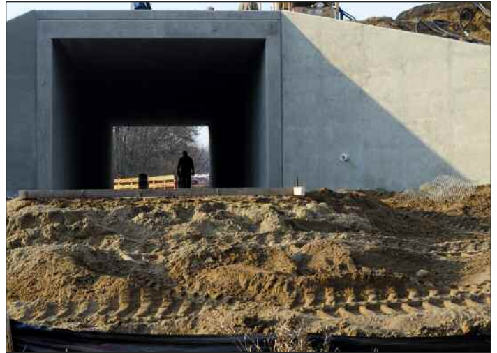
North side of the tunnel